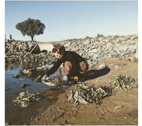
Image: Meng Zhang. Surface No 1 , 2023, digital image, 165cmx165cm.