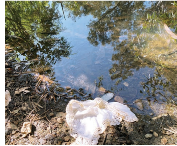
Image: Kelly Reynolds. Pigeon, 2019, single channel video. Image courtesy of the artist.

Locally based artist Kelly Reynolds aims to befriend local pigeons in proximity to Sauerbier House, including on the riverfront of Wearing Street and under the Saltfleet Street bridge. Reynolds investigates ways to connect with local pigeons and will develop visionary architecture for the ultimate pigeon palace.