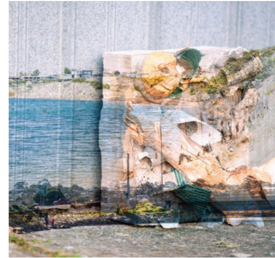
Image: J2ske. Line out, 2023, found object, digital photograph.