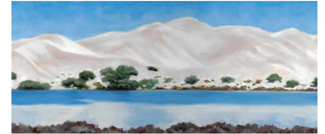
Image: Stephanie Doddridge. A Garden Recollection 1 , 2023, unique state vegetal print on rag paper, 58 x 89cm.

Doddridge draws on memories of self and place to realise through eco-autobiography, the connection formed between internal and external reflection. Memories and materials from the garden are combined, describing the intertwining of human and non-human lives. Within a garden, an exchange of reciprocal care is developed as sense impressions are recorded and imprinted as memories. Sights, smells and foods bring about recollections, revealing what is in the mind.